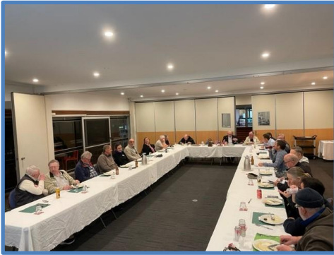
Total of 24 NIWA & CoMMA Members in attendance