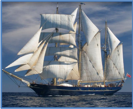
STS Leeuwin with her sails up