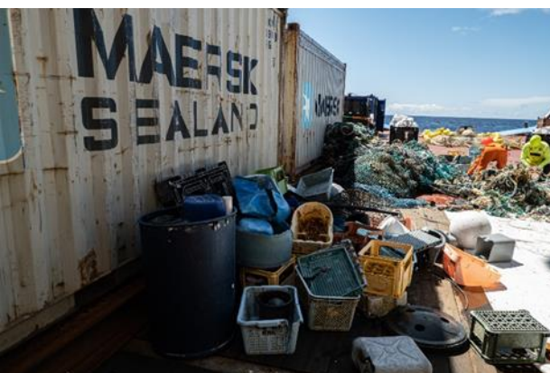
Plastic collected aboard Maersk support vessel

Docked at a Canadian port, crew members returned from a test run of the Ocean Cleanup's system to rid the Pacific of plastic trash, and were thrilled by the meagre results — even as marine scientists and other ocean experts doubted the effort could succeed.