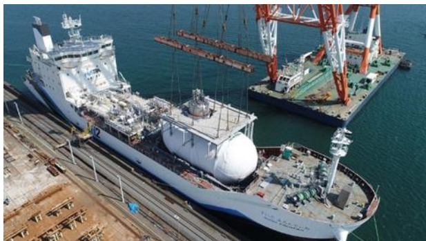
Hydrogen Tanker M/V Suiso Frontier.

understanding with two Australian energy infrastructure firms, Stanwell Corp and APT Management Services Pty Ltd, for the Central Queensland Hydrogen Project.