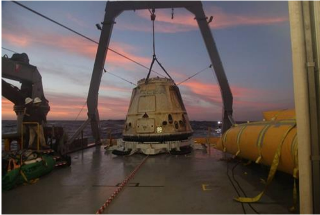
The recovered Dragon capsule.

By Steve Gorman (Reuters)- The quartet of newly minted citizen astronauts, comprising the SpaceX Inspiration4 mission, safely splashed down in the Atlantic off Florida's coast on Saturday, completing a three-day flight of the first all-civilian crew ever sent into Earth orbit.