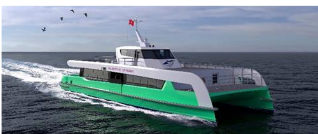
Shell Electric Ferry

Shell has ordered at least three electric ferries to transport its Singapore employees. Expected to set sail in the first half of 2023, the new 200-seater single-deck ferries will be used to transport passengers between mainland Singapore to Shell's Energy and Chemicals Park on the island of Bukom, replacing the conventional diesel-powered ferries currently used.