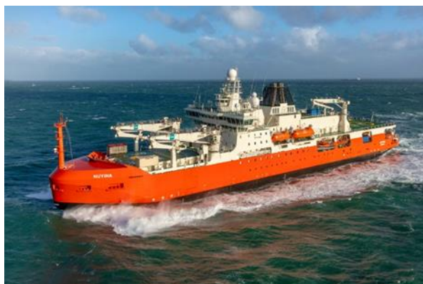
RSV Nuyina during sea trials in the North Sea.

Australia’s high-advanced new Antarctic icebreaker ‘Nuyina’ is underway on its 24,000km (13,000 nautical mile) maiden voyage home to Tasmania following delivery from Damen Vlissingen in the Netherlands.